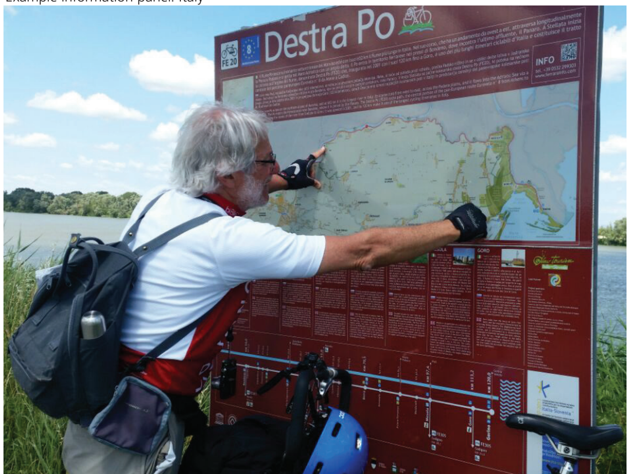
Example information panel: Italy

The following examples show how the graphic features of the EuroVelo 8 – Mediterranean Route can be used to communicate and promote the route.